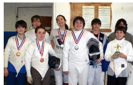
Youth Winners from Fall 08 Club Tournament